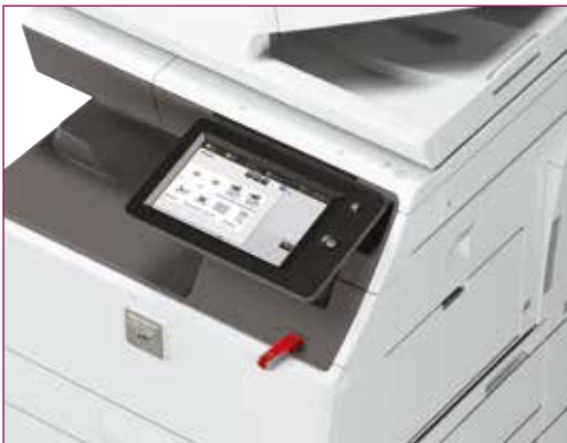
Insert your USB and start printing or scanning.

A large 500GB onboard Hard Disk Drive (HDD) can store much larger and more complex documents, and everything can be quickly accessed using an efficient Document Filing system. But for the ultimate convenience Sharp's Office Direct Print technology* lets you print whatever you want without even logging into your PC. Just walk up to your MFP, insert a USB memory stick containing images, Adobe PDFs or Microsoft® Office files and print off whatever you want. Or you can quickly scan and save documents straight to the USB stick.