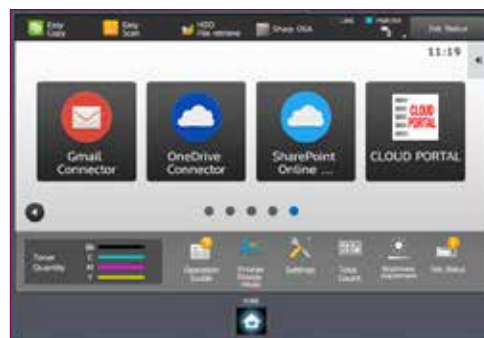
Directly connect to public cloud services and Cloud Portal Office.

And there's less risk that important or sensitive documents will be left out in the open. With the Print Release feature you can send a job to print and then, whenever you are ready, just walk over to the most convenient printer, log on and print off your information.