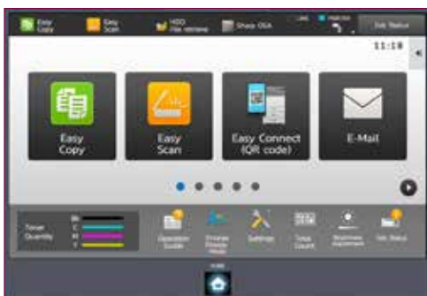
QR code icon can be easily set up on the home screen.

For even greater flexibility, their optional Dual Network Connectivity means you can share the same MFP over two different networks, one of which could be wireless, even if they have different network security settings or usage restrictions.