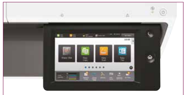
Users can customise the home screen for more efficient working.

They have a large 7-inch colour touchscreen LCD that you can tilt for easy viewing. Easy Mode also ensures that all of the everyday functions, like 'Scan' and 'Copy', are displayed in large, immediately accessible icons. Or, if there are other functions that are used a lot, you can simply drag and drop their icons onto your personal home screen for faster access.